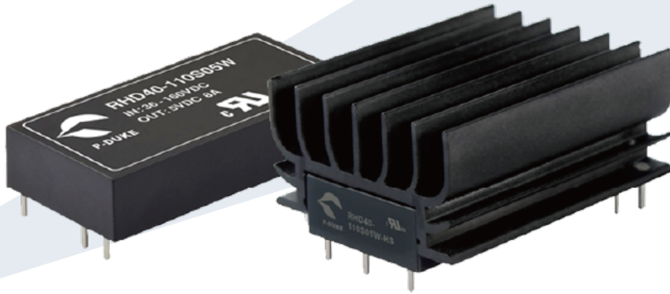
Figure 2: RHDW series of railway DC-to-DC converters.

P-DUKE's RHKW (3W/6/10W), RHMW (20W), and RHDW (40W) series DC-to-DC converters are ideal for 72V, 96V, and 110V railway inputs and meet EN 50155, EN 61373, and EN 445545-2 railway standards as well as the IEC/UL/EN 62368-1 standard (with reinforced insulation) for electrical equipment ( Figure 2 ). These converters have built-in EMI circuits that are designed according to IEC/EN 55032 class A as well as IEC/EN 50121-3-2. This massively simplifies PCB design and saves board real-estate. The transformer design allows for up to a 90.5% efficiency while also meeting the safety and isolation requirements of both harsh industrial and railway applications. They are tested for vibration and shock with a wide operating temperature from -40^{\circ}\text{C} to +105^{\circ}\text{C} and are operational at 5000 meters for rolling stock that may run through mountainous regions.